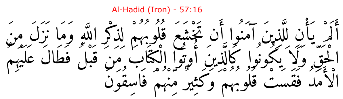
■ 57:16 IS IT NOT time that the hearts of all who have attained to faith should feel humble at the remembrance of Allah and of all the truth that has been bestowed [on them] from on high, lest they become like those who were granted revelation before, and whose hearts have hardened with the passing of time so that many of them are [now] depraved?

HAD WE bestowed this Qur'an from on high upon a mountain, you would indeed see it humbling itself, breaking asunder for awe of Allah, And [all] such parables We propound unto men, so that they might [learn to] think. - 59:21